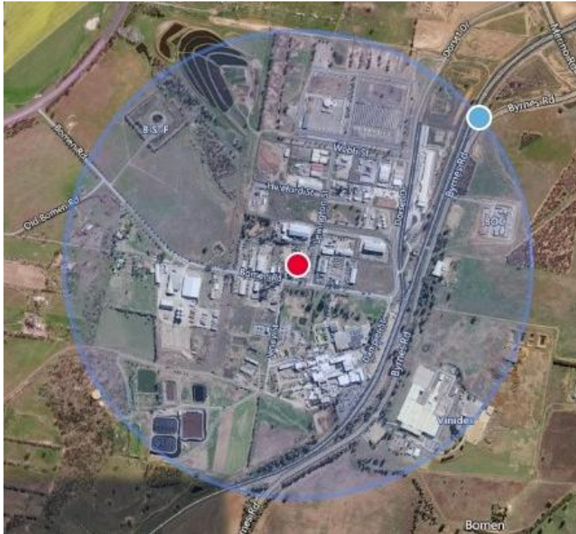
Map 1- 25 Bomen Rd and surrounding area.